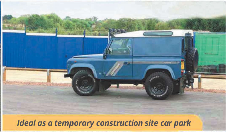
Ideal as a temporary construction site car park