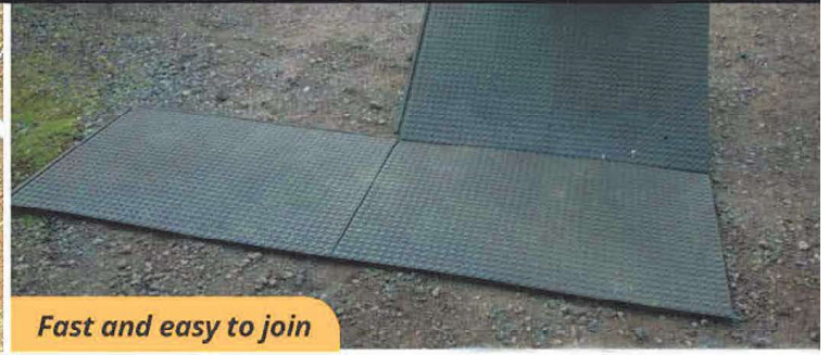
Fast and easy to join