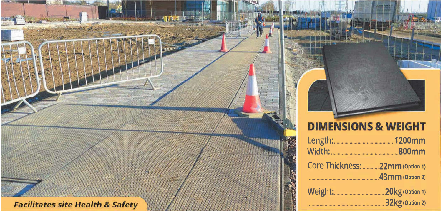
Facilitates site Health & Safety